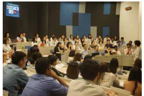
CAREER DEVELOPMENT SERIES