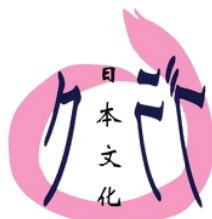
SMU JAPANESE CULTURAL CLUB (JCC) Japan