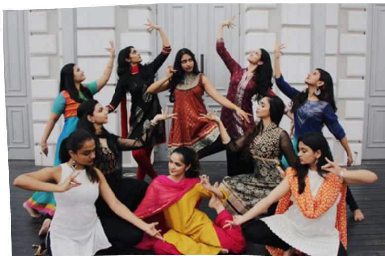
Indian Cultural Club Welcome Tea