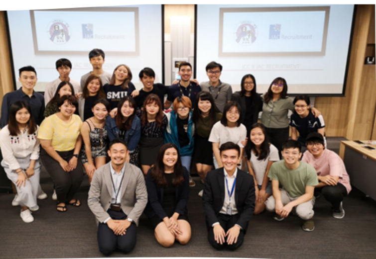
JCC networking event!