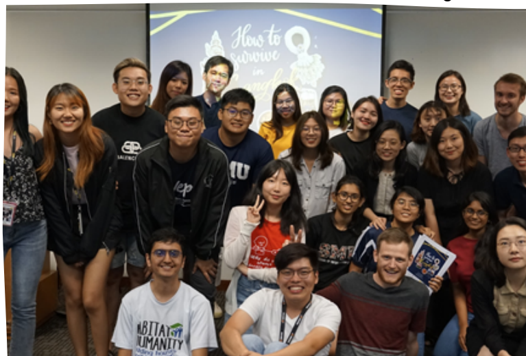
How to survive in Bangkok 101

Join our cultural club(s) and begin your ICON journey today!