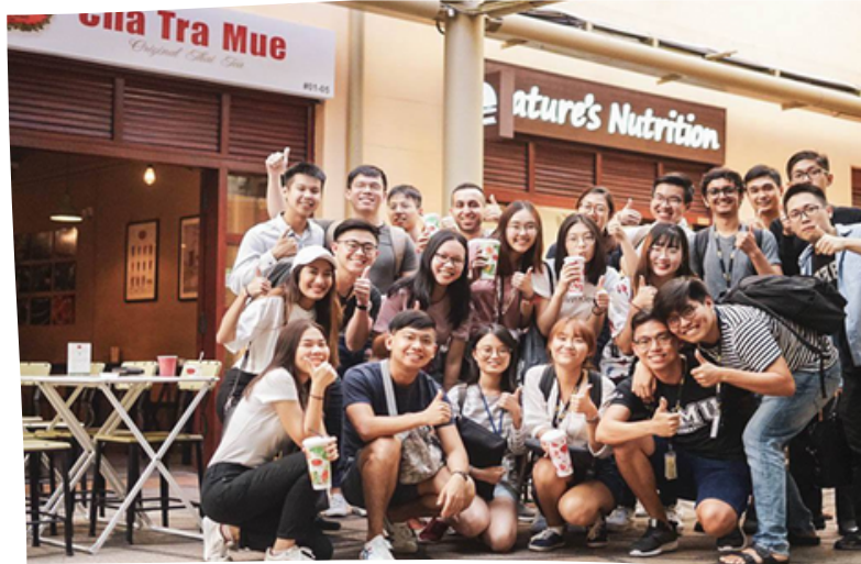
Siam Food Trail!